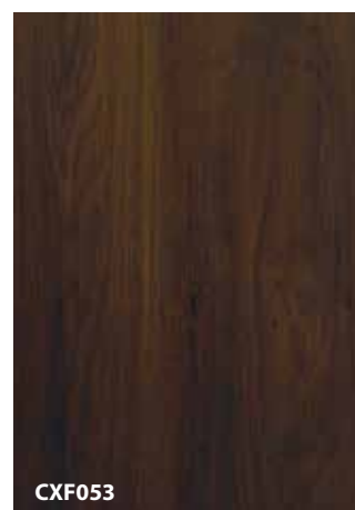
CXF053 RUSTIC OAK DARK BROWN