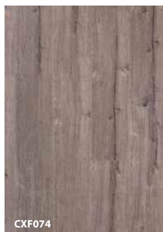
CXF074 OLD OAK DARK GREY BRUSHED