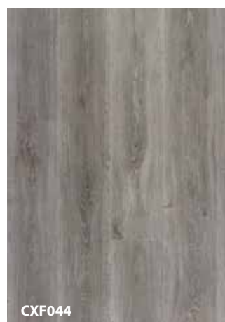
CXF044 AUTHENTIC OAK LIGHT GREY