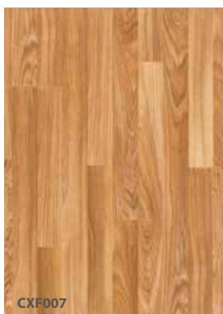
CXF007 BRUSHBOX (2-STRIP)