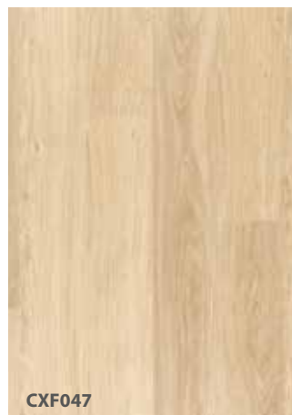
CXF047 CLASSIC OAK WHITE VARNISHED