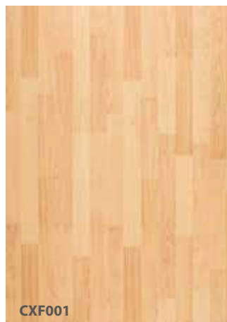
CXF001 ENHANCED BEECH (3-STRIP)