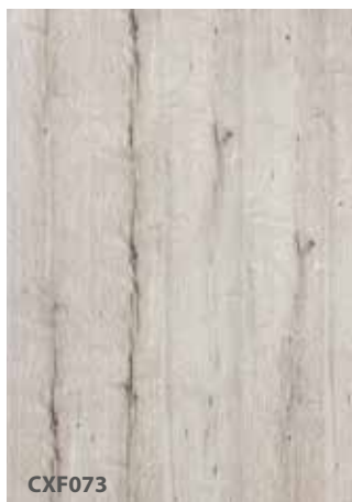
CXF073 OLD OAK GREY BRUSHED